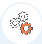
Integrated document verification technologies