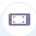
Guided image capture